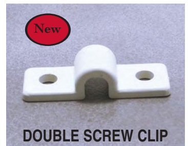
DOUBLE SCREW CLIP