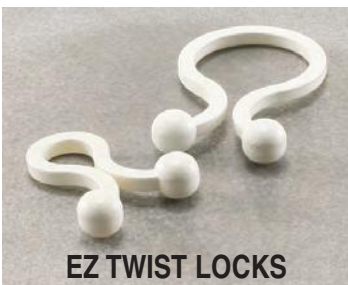
EZ TWIST LOCKS