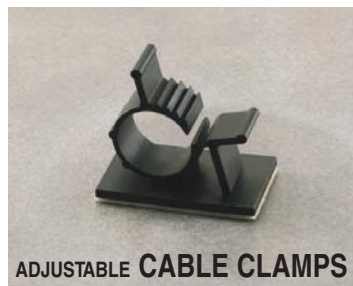
ADJUSTABLE CABLE CLAMPS