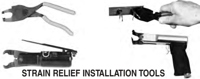
STRAIN RELIEF INSTALLATION TOOLS