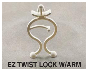
EZ TWIST LOCK W/ARM