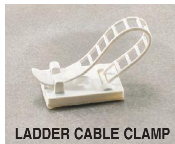
LADDER CABLE CLAMP