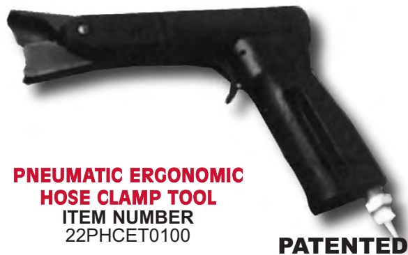
PNEUMATIC ERGONOMIC HOSE CLAMP TOOL ITEM NUMBER 22PHCET0100

NOT AVAILABLE FOR HOSE CLAMP SIZES LARGER THAN .953