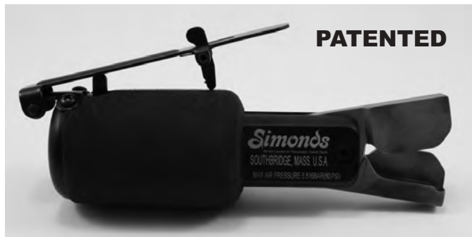
PNEUMATIC HOSE CLAMP TOOL ITEM NUMBER 22PHCT0100