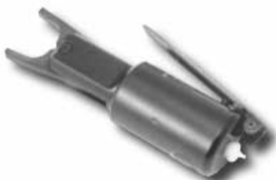
PNEUMATIC HOSE CLAMP TOOL ITEM NUMBER 22PHCT0100

Micro Plastics' Pneumatic -Ergonomic Hose Clamp Installation Tool has been carefully designed to help reduce the wrist fatigue associated with the rapid assembly of Nylon Hose Clamps. The easy trigger-type actuation of this air tool, in combination with the ergonomic angle of the hand grip, allows natural alignment of the wrist and hand during normal clamp installation. The tool operates on standard shop air from 30-100 PSE. Lightweight, only 18 ounces. Tools are configured prior to shipping. Please specify Hose Clamp sizes to be installed when ordering.