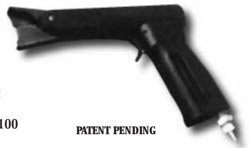
PNEUMATIC ERGONOMIC HOSE CLAMP TOOL ITEM NUMBER 22PHCET0100

NOT AVAILABLE FOR HOSE CLAMP SIZES LARGER THAN .953